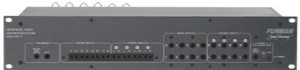
HDS-16 Headphone/Audio Distribution System