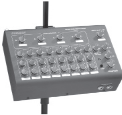
HRM-16 Headphone/Audio Remote Mixer